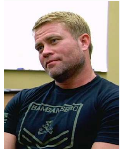
Tim Ballard's career inspired the movie.

During the film's theatrical run, multiple outlets and moviegoers reported theaters claiming to be sold out, though seats in the auditoriums were empty. Some attribute this to pay-it-forward sales by Angel Studios. A message at the end of the film urges viewers to buy an extra ticket "for someone who would not otherwise be able to see the film," suggesting many of the extra tickets were left unused, resulting